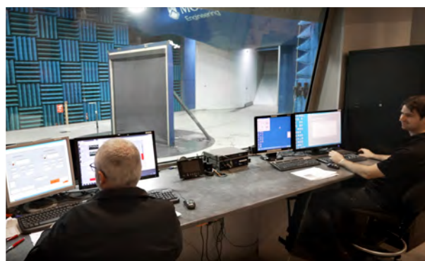
2.4m x 2.4m Zipscreen after withstanding 140 km/h.

*The Zipscreen shade was side fixed to a timber substrate and secured to a steel frame with 12G fasteners. Inner rails were secured with 8G fasteners as per the Zipscreen Installation Manual guidelines. Each wind speed test was held for a minimum of 60 seconds. 'Maximum achievable wind speed' refers to the limitations of the testing facility, and not the Zipscreen system.